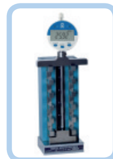
Zeroing the indicator using an extension rod and a setting master.