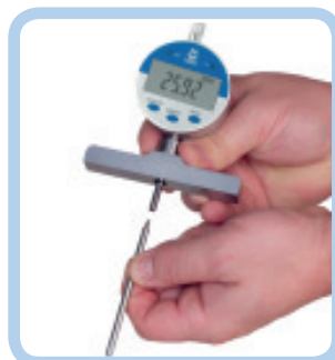
Installation of an extension rod.