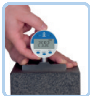
Zeroing the indicator on a flat surface. (without the extensions)